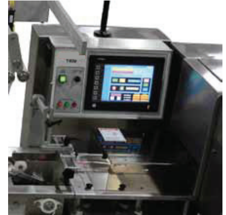
Quick Changeover | Simple machine control layout and adjustable former.

The H150M's unique EZ-SET end crimper phasing control allows the operator to position the crimper between products during initial setup, then easily fine tune the setting—all while the machine is running. Most size changes do not require tools. It is powered by a robust 1 HP AC drive motor with plenty of reserve power to drive feeding devices and other accessories. Also available as a shrink wrapper. The shrink version requires compressed air (2 CFM @ 80PSI).