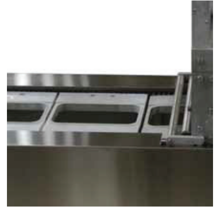
Quick-change tray holders | For processing various container sizes

Casters and a 110-volt electrical supply make the TD30M portable and flexible in operating the machine in a convenient location. The stainless steel and aluminum construction is ideal for strict sanitary applications.