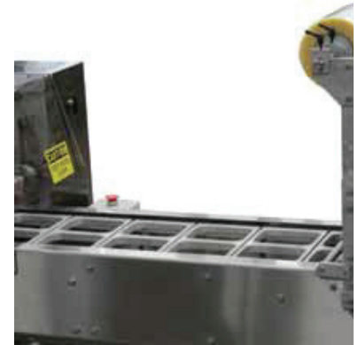
Wide film width | Allows for multi-lane configuration