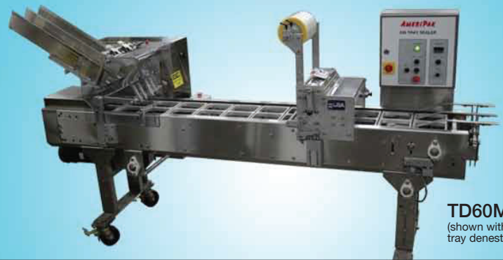
TD60M (shown with optional tray denester)