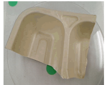
4724.8mg analyzed (1mm x 1mm scale)

Disclosures: All work was done at Beta Analytic in its own chemistry lab and AMSs. No subcontractors were used. Beta's chemistry laboratory and AMS do not react or measure artificial C 14 used in biomedical and environmental AMS studies. Beta is a C14 tracer-free facility. Validating quality assurance is verified with a Quality Assurance report posted separately to the web library containing the PDF downloadable copy of this report.