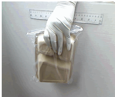
View of content