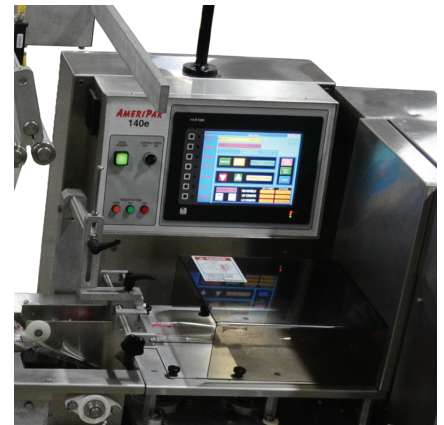
Quick Changeover | Simple machine control layout and adjustable former.

The H150M's unique EZ-SET end crimper phasing control allows the operator to position the crimper between products during initial setup, then easily fine tune the setting—all while the machine is running. Most size changes do not require tools. It is powered by a robust 1 HP AC drive motor with plenty of reserve power to drive feeding devices and other accessories. Also available as a shrink wrapper. The shrink version requires compressed air (2 CFM @ 80PSI).