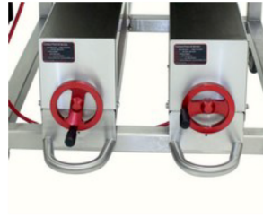
Individual deposit size and deposit speed adjustments