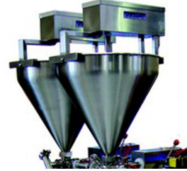
Custom hopper with stirrers