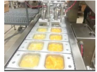
Ideal for integration with dual lane tray sealing and form-fill lines