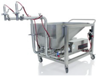
Custom Low Level version