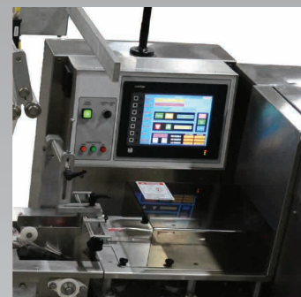
Quick Changeover | Simple machine control layout and adjustable former.

The Series 150 is easily customized to meet specific packaging needs and is available in right or left hand configurations.