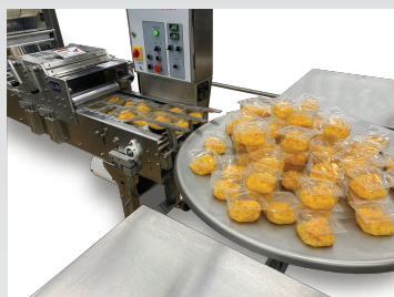
Lazy Susan With Side Tables

Lazy Susan (rotary turn table) Adjustable side table Spare parts kit