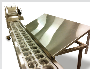
Roll Up Or Attached Side Tables