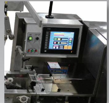
Quick Changeover | Simple machine control layout and adjustable former.