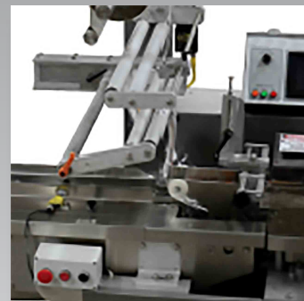
Adjustable Former | Easy size changeover for different products

A variety of roll stock materials, printed or clear films are suitable on these machines.