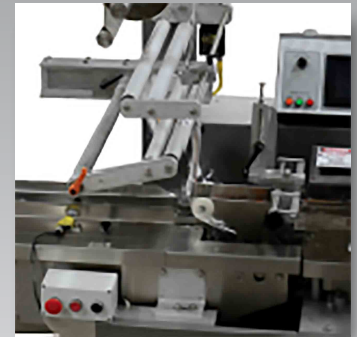
Adjustable Former | Easy size changeover for different products

A variety of roll stock materials, printed or clear films are suitable on these machines.