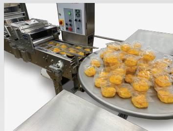
Lazy Susan With Side Tables

Lazy Susan (rotary turn table) Adjustable side table Spare parts kit