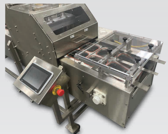
Cover Safety Guarded Discharge