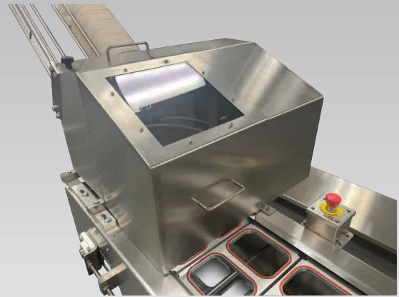
Pick and Place Tray Dropper

Heat Seal: PID Controlled heater heads w/stainless nife blades to seal and cut film with minimum allowable scrap. Die Cutting to the shape of the tray is also possible. Scrap take up is easily accessed and removed. Film feed is servo controlled for either random feed or registered print with optional slot sensor. Film roll diameter not to exceed 10 inches. If no cup is present then station will not operate.