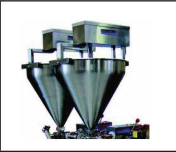
Custom hopper with stirrers