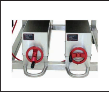
Individual deposit size and deposit speed adjustments