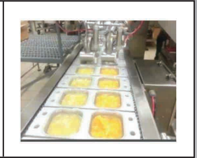
Ideal for integration dual lane tray sealing and form-fill lines