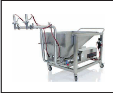
Custom Low Level version