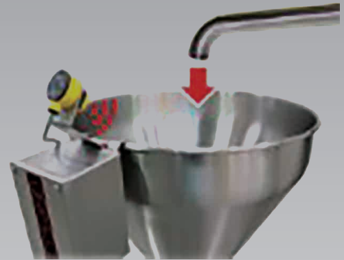
Optional Photo Sensor monitors product level in the hopper and controls the pump