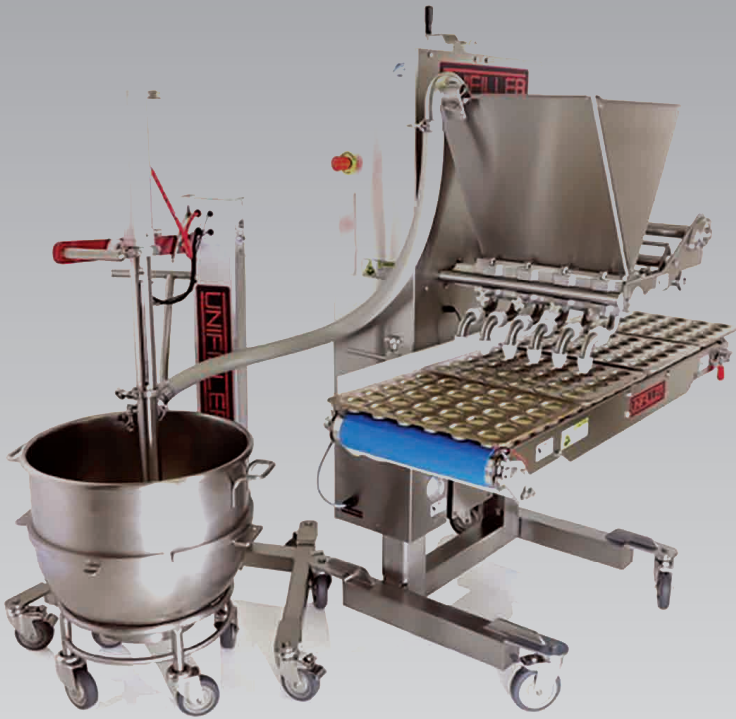
A perfect fit with the MultiStation